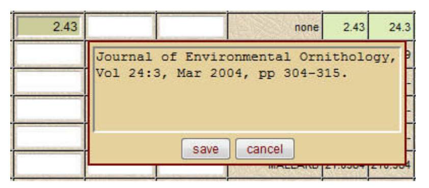
Figure 6 – Cell Annotation Editor