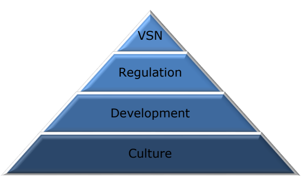
Figure 2. A Pyramid Model of VSN Diffusion

The pyramid model in Figure 2 reflects the different natures of telecommunication development and user regulation, country culture in terms of their influences on VSN diffusion. Telecommunication regulation has a relatively direct but volatile impact, and thus it is the foundation immediately underneath the VSN innovation. User culture has rather indirect but long-lasting influence, and thus it is the foundation at the bottom. Taking some effort and time to change, country development is related to both user base and telecommunication industry, and it is the foundation in the middle.